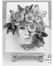
2D Sugar Art plaque